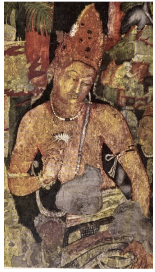
Bodhisattva with Lotus, Ajanta Caves

The rise of the movement referred to as the Mahāyāna, some four hundred years after the Buddha's death, is sometimes marked by the appearance of new sūtras that were called the 'perfection of wisdom' (prajñāpāramitā). Like many other Mahāyāna sūtras, the perfection of wisdom texts were not systematic treatises that set forth philosophical points and doctrinal categories in a straightforward manner. Instead, they strike the modern reader as having something of the nature of revelations, bold pronouncements proclaimed with certainty, rather than speculative arguments developed in a linear fashion. The perfection of wisdom that the sutras repeatedly praised was often identified as the knowledge of emptiness ( sūnyatā ), and it was this knowledge that was required for all who sought to become buddhas. This emptiness was often presented in a series of negations, with statements like 'that which is a world system, that is said by